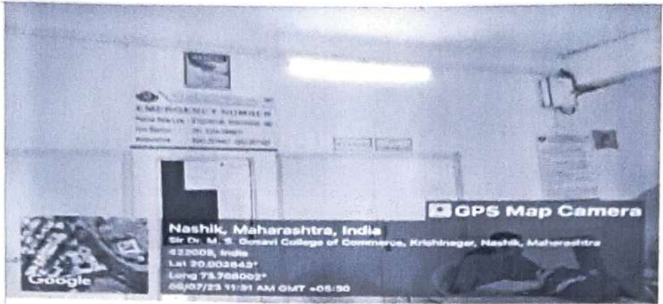
Use of LED bulbs

7.1.3 Describe the facilities in the Institution for the management of the following types of degradable and non-degradable waste (within 200 words)